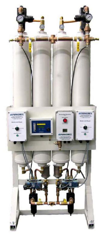
MEDICAL DESICCANT DRYER PACKAGE

The PMD series desiccant dryer is designed to remove moisture and contaminants from the compressed air. The air is treated to provide air quality exceeding the specification on NFPA99 Category 1 medical air.