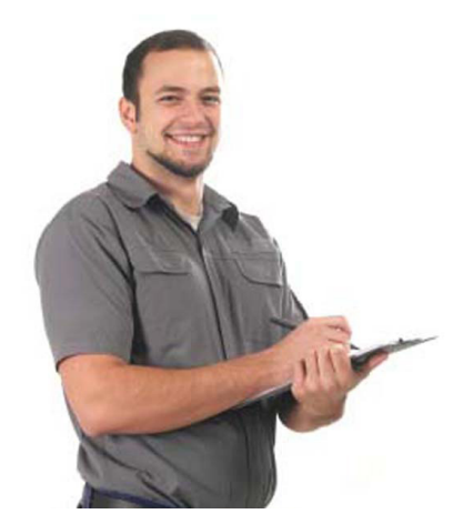
Lewis Systems & Service has ASSE 6040 Medical Gas System certified technicians, available for inspection, testing, and maintenance of your medical gas systems, based on the 2012 edition of NFPA 99.